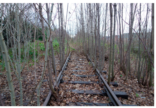
Old railway line

Giant Sequoia: This native tree of California typically grows on the western slopes of the Sierra Nevada. It was introduced to the UK in 1853 and can live more than 300years. It is the largest known tree species on earth.