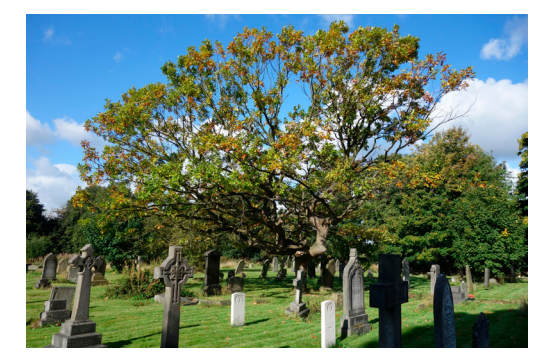
Oak, St Martin's Church