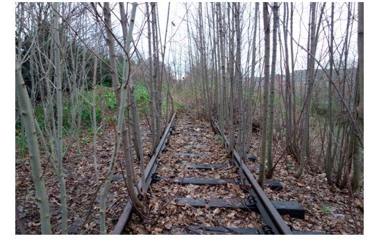
Old railway line

4 Giant Sequoia: This native tree of California typically grows on the western slopes of the Sierra Nevada. It was introduced to the UK in 1853 and can live more than 300years. It is the largest known tree species on earth.