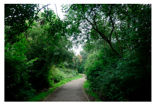
Trans Pennine Trail