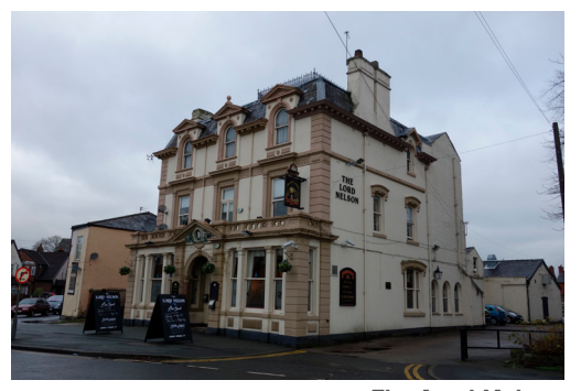
The Lord Nelson