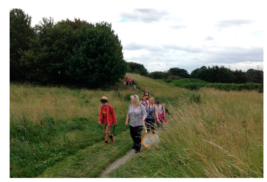
Butterfly Picnic walk

This small marshland habitat supports a rich variety of wetland birds and other species, including sedge and reed warblers. The old sewage works nearby are an important undisturbed site for wildfowl in winter, and migratory birds in spring and autumn.